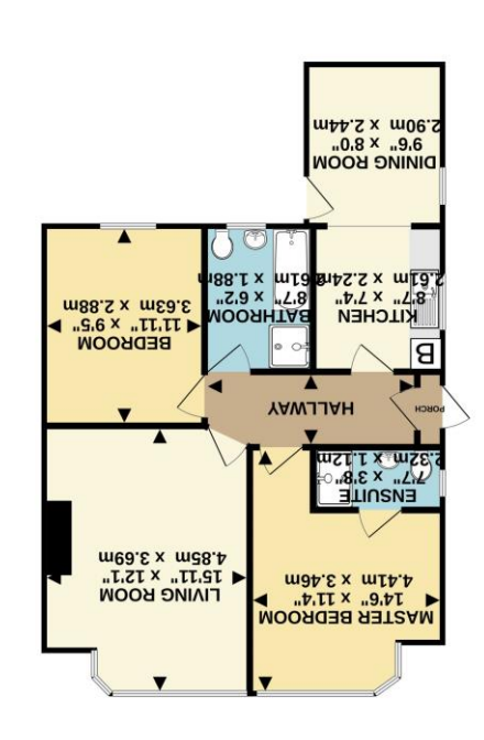
GROUND FLOOR 838 sq.ft. (77.8 sq.m.) approx.